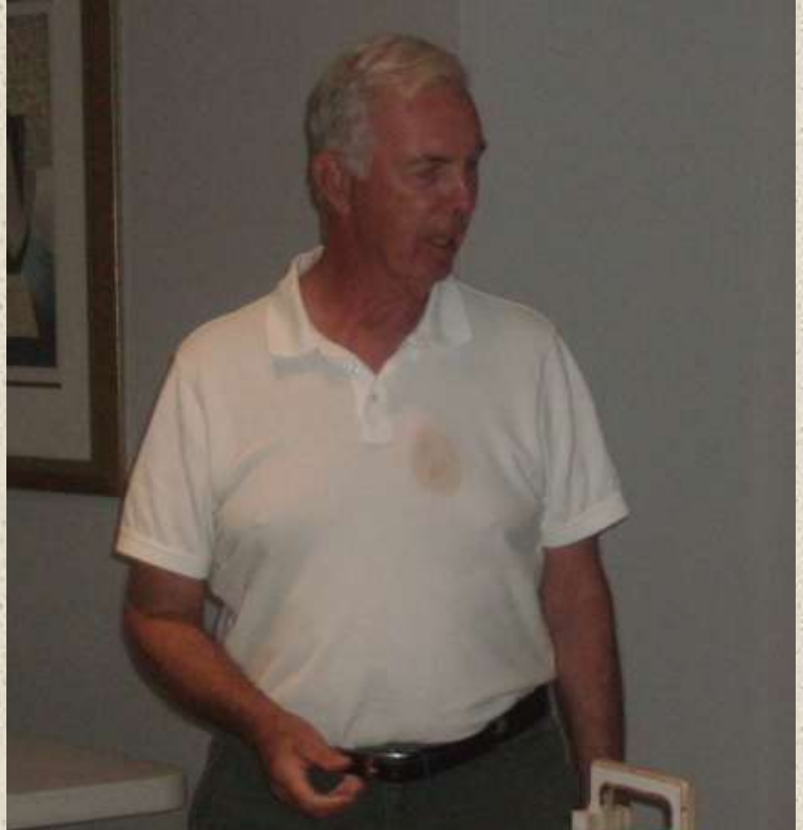
“Show and Tell” at the last RD-RC Monthly Meeting